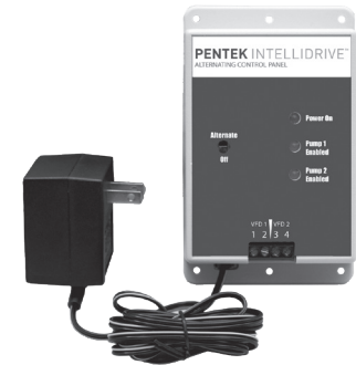
VFD-ALT VFD Alternating panel