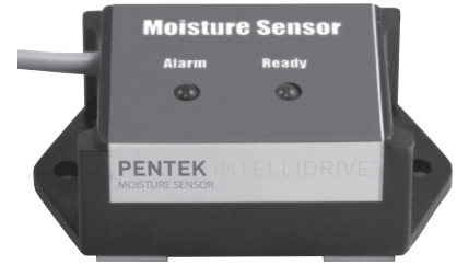
VFD-WS VFD Water sensor with 15' cable