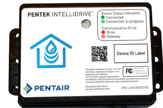
VFD-LINK Wireless Translator for Pentek Intellidrive

Pentair Pentek® Transducer for use with Pentek Intellidrive and Intellidrive XL.