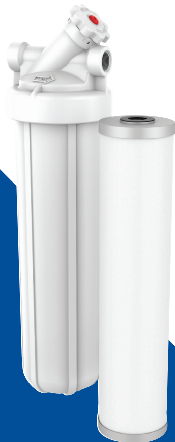
Pentair LR-BB50 Heavy Duty Lead Filtration System (Cartridge Included)

Undesirable contaminants such as lead and cysts can exist in original water sources or pipes outside your home and can cause a variety of health issues. The Pentair® Heavy Duty Lead Filtration System can reduce these contaminants before they enter your home.