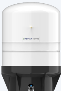
10-gallon hydropneumatic tank