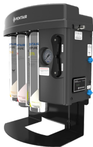
EZ-RO 375/10G-BL with optional floor stand bracket